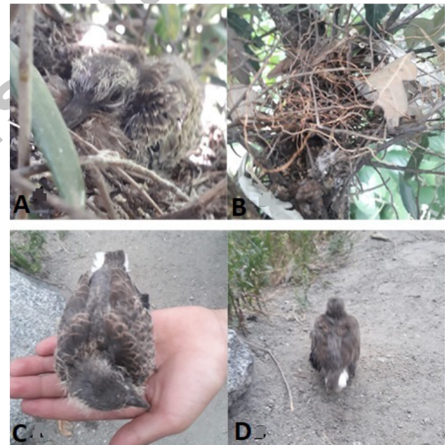
Fig. 3. Nidification (A), hatchling (B) and predation (C, D) of spotted dove in village Takoro at District Dir Lower, KP, Pakistan.